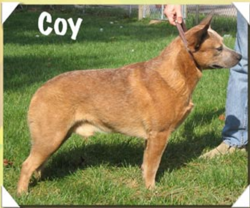
Ch. Katwala's Orange & Blue, PT, QW