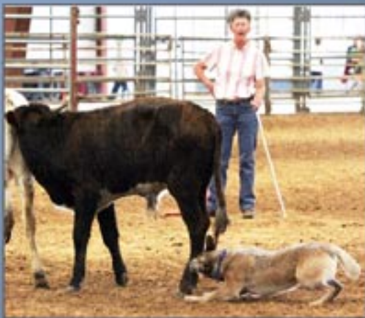
Siva, on the same day, doing what Cattle Dogs do best.