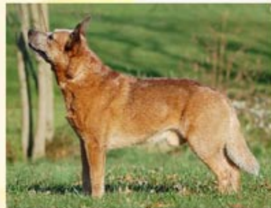
Ch. Katwala's Orange & Blue, PT, QW PennHIP, Elbows Normal, BAER Normal, PRCD Obligate A