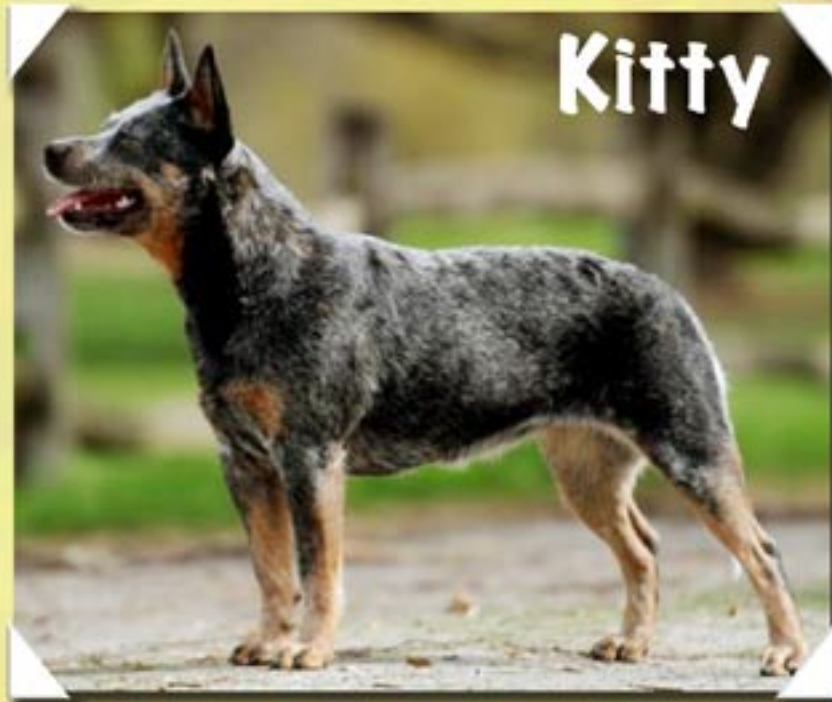
Bryn Mawr's Terranova at Madcap, (pointed) NA, NAJ, NF